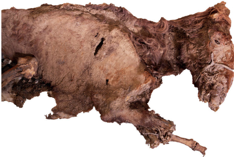
G. 3. The Üzüür Gyalan Horse from The Hovd Province, Mongolia

The horse skeleton was mummified. Its fore and hind limbs were extended, and it was laid leftwards (G. 3 and G. 4). Buried with a simple leather halter attached to its head, the horse was covered by a layer of skin and hair (G. 3). The coat color of the horse is likely to be chestnut. It was a male horse of approximately 15 years of age (with distinct canine teeth). A close examination of the skeletal remains – especially the lack of a tuberculum pubicum dorsale in pelvis and a pit in this area – strongly suggested that it had been castrated.