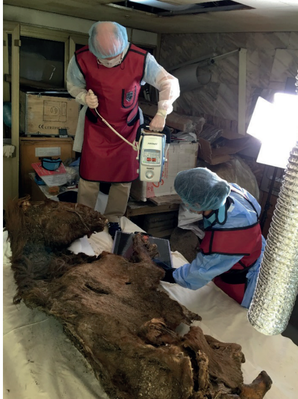
G.7. Radiographic Shots

An evaluation of the radiographs indicated a pre-mortem fracture in the forehead section (frontal area) of the horse's skull (G. 8). The horse's (frontal) data strongly suggested that it suffered a hard blow to its forehead right before its death. Given that its entire body was covered with mummified skin, the collapse in the horse's forehead was not visible to the naked eye and could only be detected through radiographic scanning.