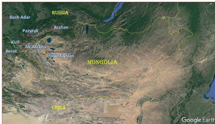
G.1. The Location of the Üzüür Gyalan Tomb With Respect to Other Tombs.

This burial site, which is claimed to be from the Göktürk period, is located 35 kilometers to the north-west of the Mönkhairhan city center and at coordinates 48°33'33.3"N 91°28'06.4"E.