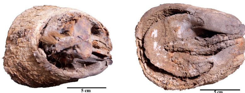
G. 6. The Right Fore Hoof ( capsula ungulae ) of The Üzüür Gyalan Horse With Bones ( phalanges )

An examination of its right anterior hoof ( capsula ungulae ) suggested that the horse had never been shod in its lifetime (G. 6). The hoof's maximum width was 104.71 mm, and its maximum length was 136.27.