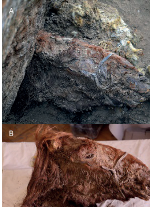
G. 4. The Leather Bridle of The Üzüür Gyalan Horse. A. In situ Skull, B. Skull After Being Cleaned

It was observed that the horse had no discernible pathology (except for its front metacarpal, and its dental and skeletal structure were in good condition. As a result of the ossification of the ligamentum interosseum, it was determined that a bone fusion occurred between Mc2 and Mc3 in the left metacarpal. However, fusion did not take place between Mc4 and Mc3 (G. 5). A similar condition could be observed in the right metatarsal. While the ligamentum interosseum between Mt2 and Mt3 was ossified, no trace of pathology could be discerned between Mt4 and Mt3. Each piece of data suggested the existence of medial splints in both the fore and hind metapodials.