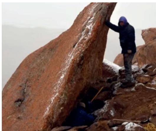
G.2. The Location of The Female Mummy With Horse 12

Upon excavating the rock hole (G. 2), the archeologists found a burial of a woman who was buried with her garments, some materials she had used in her daily life, a mummified skeleton of a horse along with its tack materials, and some sheep remains. The lower part of the skull, neck and back of a dried human body could easily be seen while entering into the bottom right side of the tomb. 11 These exposed parts were contaminated by the outside environment. The garment and felt at the back of the dead body, were eaten away by animals and – inevitably - had lost their original condition.