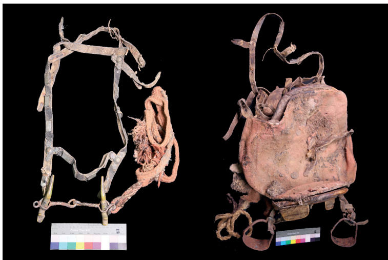
G. 9. The Horse Harness (left: bridle; right: saddle)

The saddle is supported by wooden material that made it more conducive for riding than for using the horse for transport and labor. The stirrups are made of metal and tied up with a strap made of leather. Supported by wood, the front of the straps stands higher than the rear side. The metal stirrups to the left and right side of the saddle are approximately 14 cm long. 18