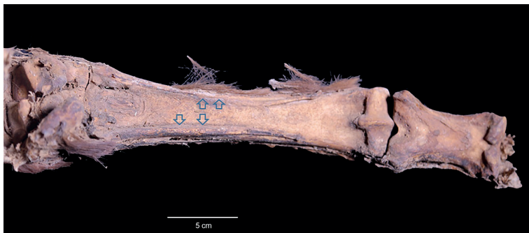
G.5. Left Metacarpus. Arrows: The Ossification of The Lig. Interosseum

It was observed that the horse had no discernible pathology (except for its front metacarpal, and its dental and skeletal structure were in good condition. As a result of the ossification of the ligamentum interosseum, it was determined that a bone fusion occurred between Mc2 and Mc3 in the left metacarpal. However, fusion did not take place between Mc4 and Mc3 (G. 5). A similar condition could be observed in the right metatarsal. While the ligamentum interosseum between Mt2 and Mt3 was ossified, no trace of pathology could be discerned between Mt4 and Mt3. Each piece of data suggested the existence of medial splints in both the fore and hind metapodials.